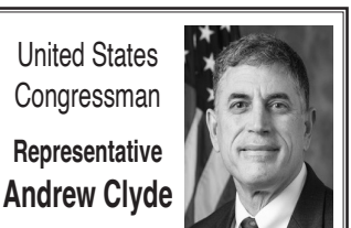
United States Congressman Representative Andrew Clyde

During the final days of the U.S. Supreme Court's 2023-2024 term, our nation received several key rulings that represent huge wins for the U.S. Constitution, the American people, and the future of our country. Given the significance of three decisions, I wanted to share my thoughts with you on these major judicial victories.